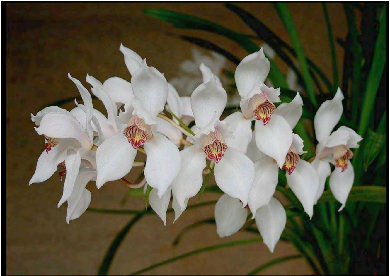
A delightful, early season bloomer Cym. erythrostylum 'Dale' species