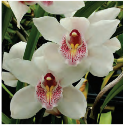
Cym. Balkis 'Silver Orb'