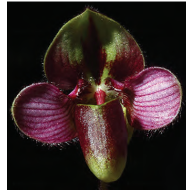
Paph runggurayianum